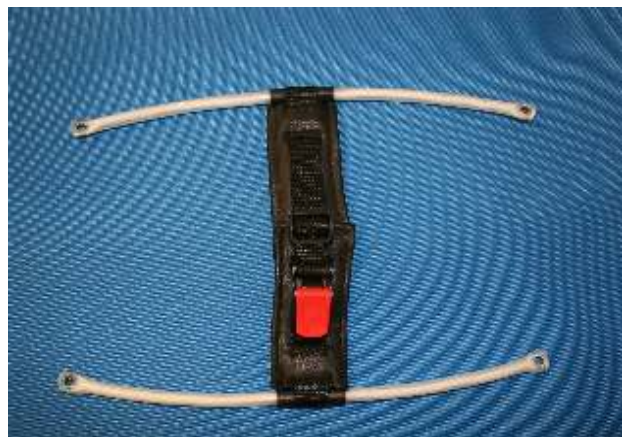
This photo shows the new plastic coated rope loop